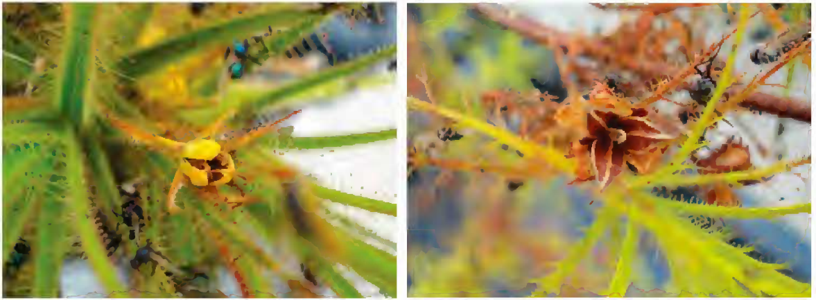
Figure 5: Roridula gorgonias dehiscence (left) and Roridula dentata dehiscence (right).